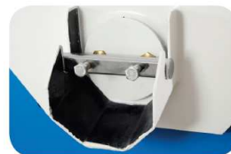
COMPUERTA DE VACIADO