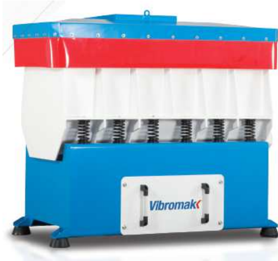
MODELO VKT-800 Y SUPERIORES