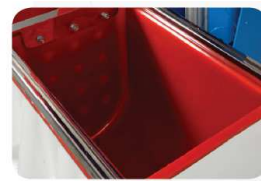
GUIAS PARA DIVISOR